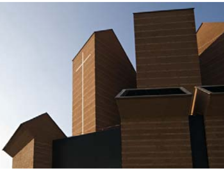
Impressive: Mario Botta's new ecclesiastical building in Turin.

Completed in: 2006 Furniture: on stage, yeah!